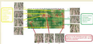
Figure 1. Orthophotoplan made by UV drone interpreting sunflower culture data

The impact of the AGRODATA project on Romanian agriculture and research was very large, the researchers from SCDA Brăila being the first to use a series of state-of-the-art technologies. Why is this project important for Romanian agriculture? With the help of the technologies used, each farmer who joins this project can monitor each crop in real time so that, for each crop, a dashboard is created that has the role of providing the farmer with all the information in order to make a decision in time. real. Through this project, a series of analyzes were carried out on the soil and agricultural crops, analyzes on the agrochemical mapping of the soil (content of moving elements in the soil), scanning the soil with a precision drone, and the degree of disease attack and pests in crops overflown by drones. Following the soil and plant scanning processes, after downloading and processing the data, the researchers from SCDA Brăila came up with a picture on the corn sunflower. Following these scans, in the maize crop, at certain plots (P1, P2 and P6- the red spots identified with the red color in the orthophotoplan) a low nitrogen content (in the soil structure) was identified, a "ragged" aspect of sunflower, the appearance of the burning phenomenon on the leaves of sunflower plants ( Setosphaeria turcica ) and the appearance of embers ( Shacletotheca reiliana ).