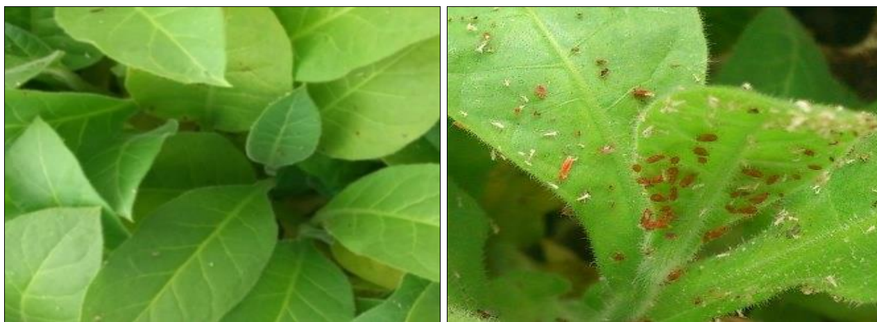
Figure 1. Comparisons of control treatment had high infection by aphids (right) and seed dressing treatment had low infection by aphids (left)